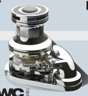
VWC Vertical Windlass & Chainpipe