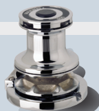
VW Vertical Windlass