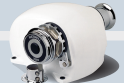
HWC Horizontal Windlass & Capstan